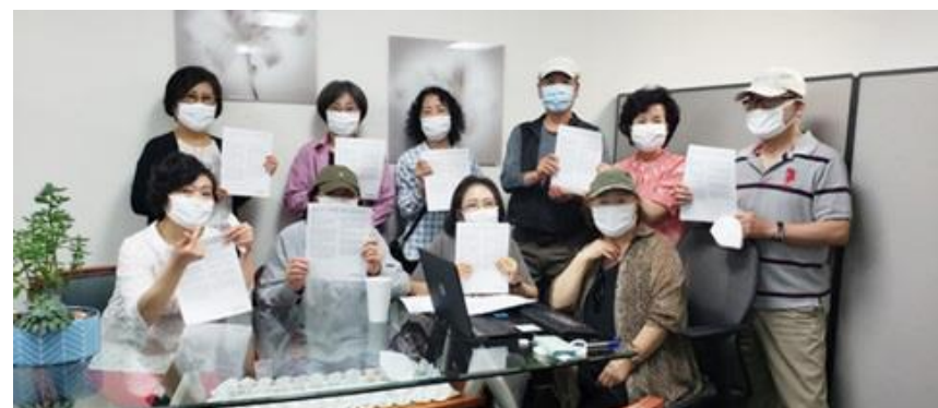
*Prioritization by the Seattle Freight Advisory Board